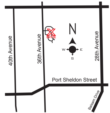
LOCATION MAP NO SCALE