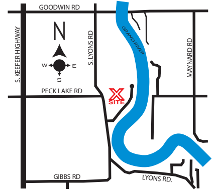
LOCATION MAP NO SCALE